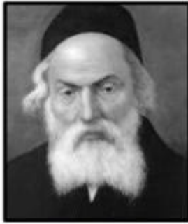
The Chofetz Chaim

It should not suffice to request but instead, we should demand the redemption... Several times a day , we request in our prayers the Redemption. Nevertheless, requests alone do not suffice. One must Demand the Redemption in the same manner that an employee asks for his salary. The Halachah (Law) is, unless an employee demands his wages, there is no obligation upon the employer to pay on the same day. We too must Demand the Redemption, for if we do not insist, we then render it as unimportant issue .